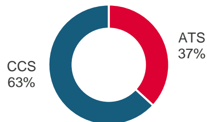
Q3 2019 Revenue 4